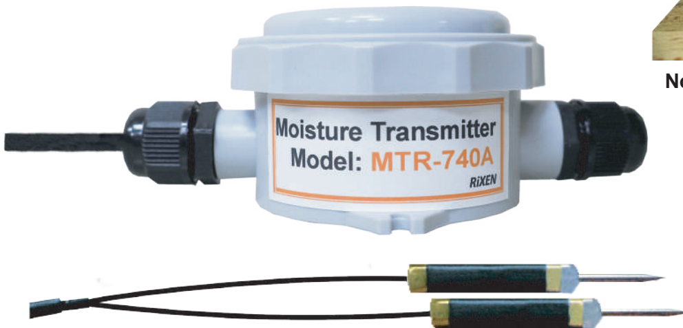
MTR-740 Moisture Transmitter No.7018 Moisture Electrodes